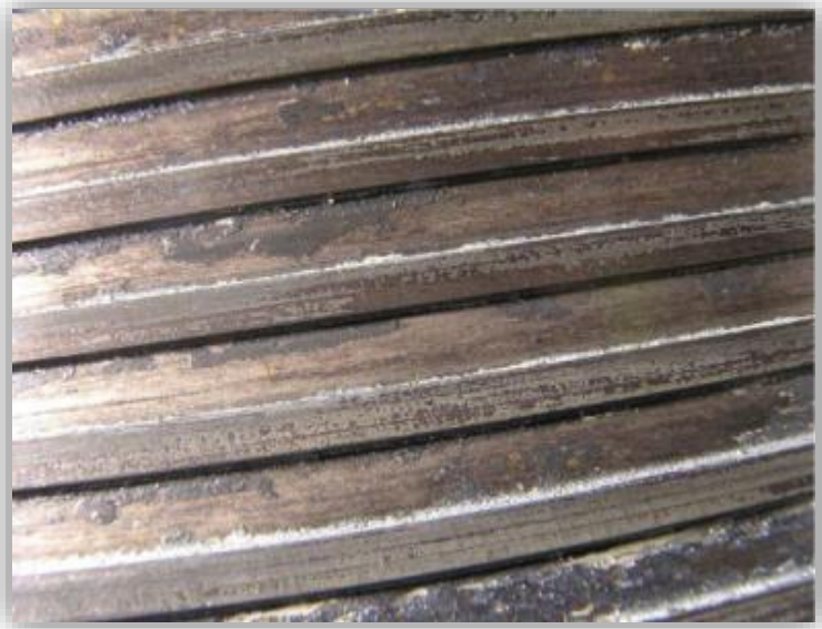
Gun Barrel 066 after manual cleaning method was applied (24 Cycles)

After the barrel has been cleaned and dried the barrel cleaning system can be used to apply weapon oil, that not only offers a superb protection against rust and corrosion, but in fact prevents the tight adhesion of subsequent firing residues. These fluids will be injected in different time zones depending on the type of cleaning program.