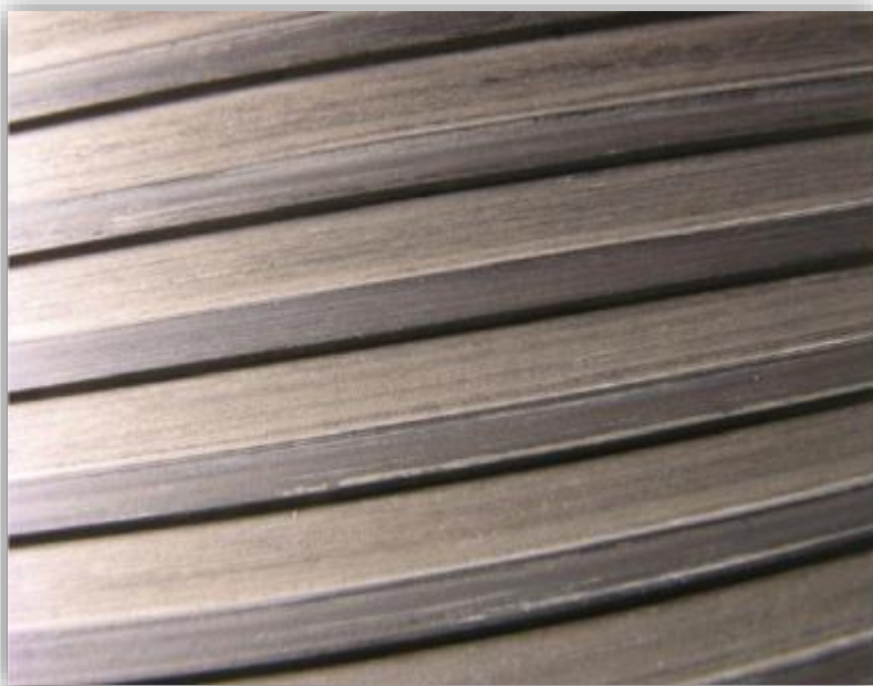
Gun Barrel 066 after Automatic Cleaning System was applied (12 Cycles)

During meticulous barrel cleaning research the optimal cleaning time were established.