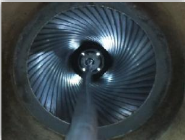
Cleaning System in operation

The System is designed and developed to meet five requirements: